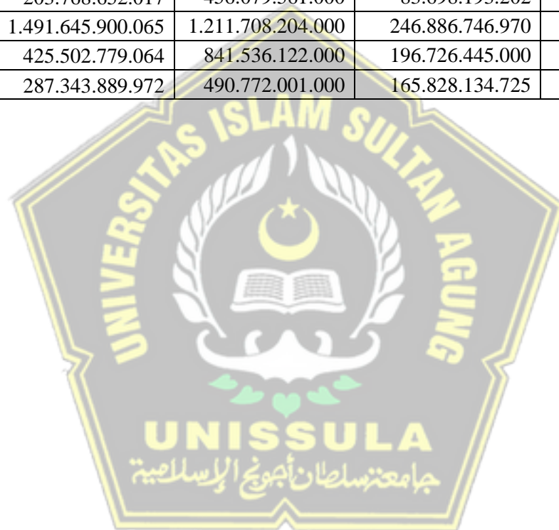
Tabel Pertumbuhan Ekonomi, Pendapatan Asli Daerah, Dana Alokasi Umum, Dana Alokasi Khusus, Dana Bagi Hasil dan Belanja