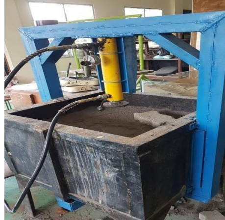
Pengisian bedding sand