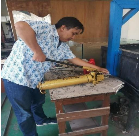
Proses pemberian beban