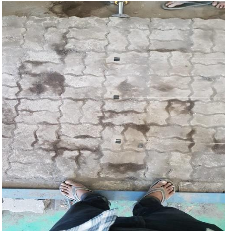
Unipave penataan basketweave