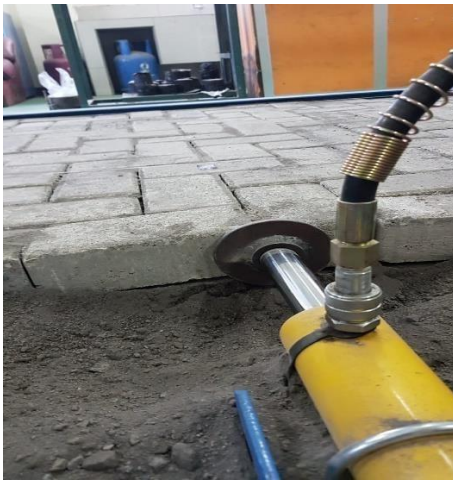
Horizontal force test