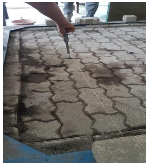
Pengukuran horizontal creep