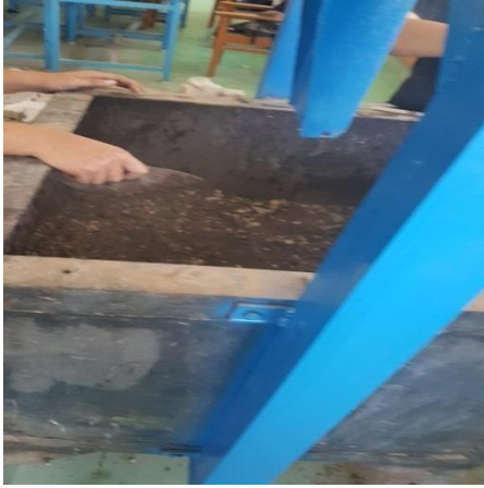
Pengisian Sub Grade