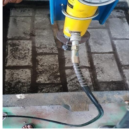
Push-in test Holland