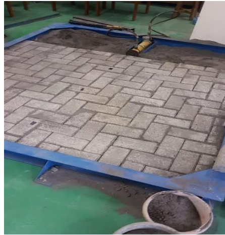
Holland penataan herringbone