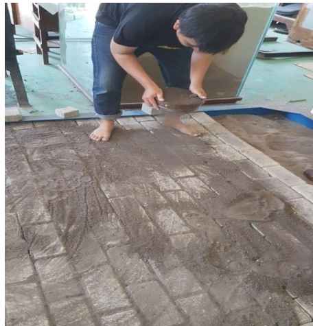
Pengisian jointing sand