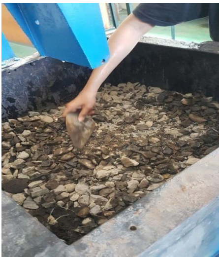
Pengisian base course