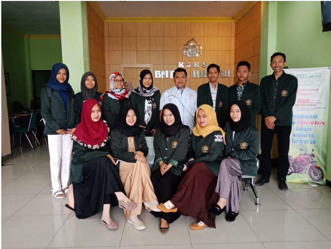
Staff Karyawan BMT Al-Hikmah