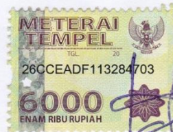
Dini Nur Islamiyati