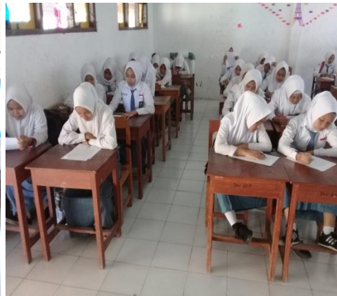
Pre-test Experimental Class