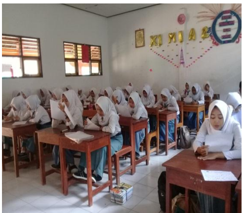
Post-test Control Class