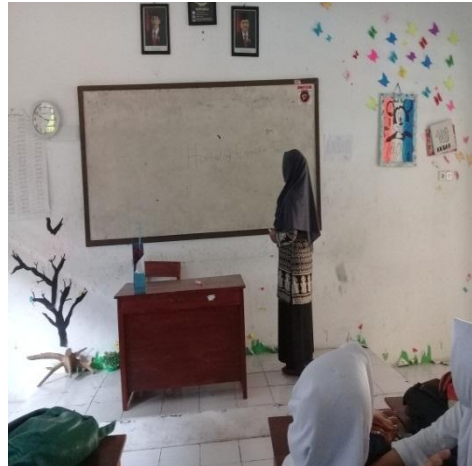
Treatment Experimental Class