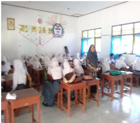
Treatment Control Class