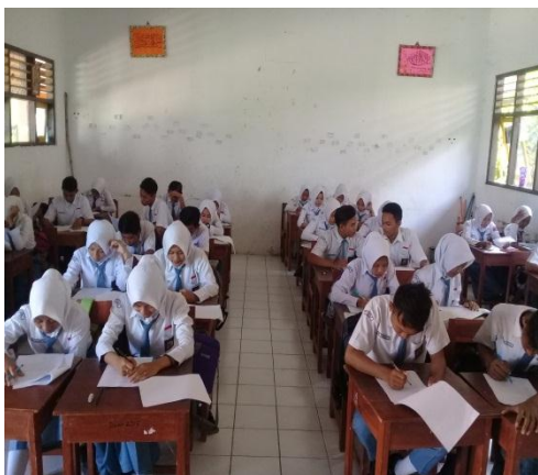
Post-test Experimental Class